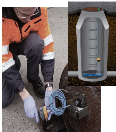
Smart manhole covers help protect the environment from sewer spills.

The sensors in smart covers transmit wirelessly to mobile devices so they can be monitored 24/7 and provide alarms of potential emergency conditions.