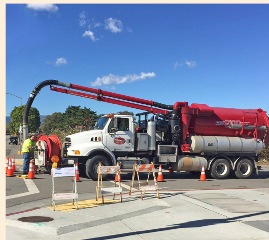
To prepare for potentially large El Niño storm flows, the District is conducting additional sewer pipeline maintenance.