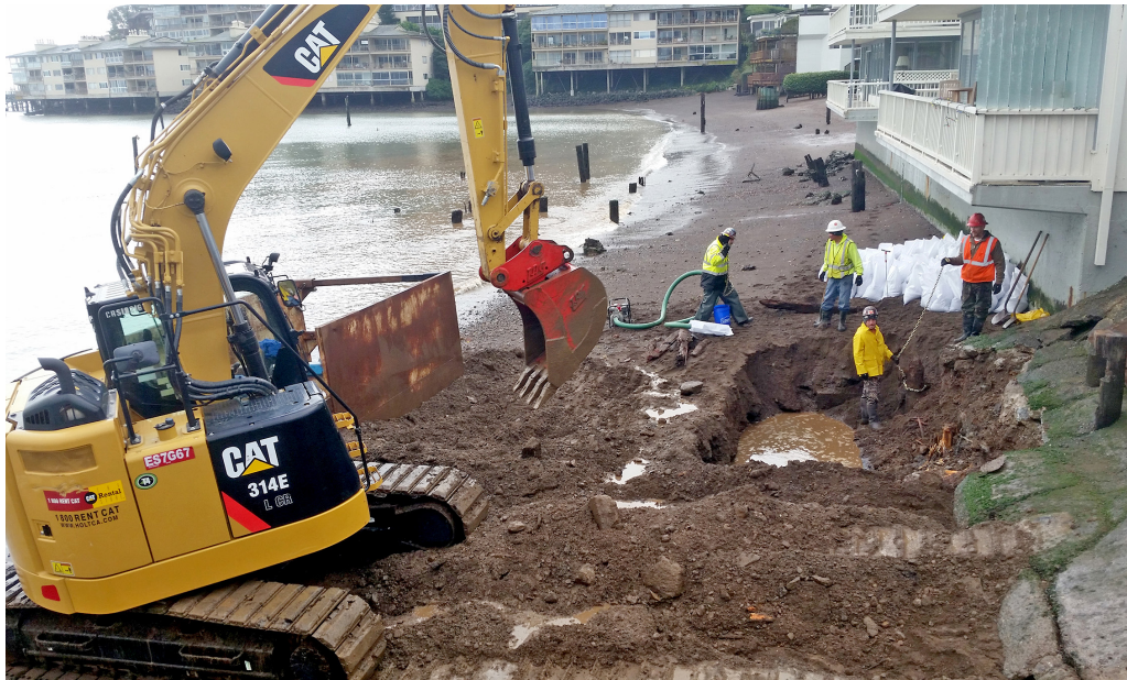
Excavation of Beach Force Main at the bottom of Main Street.

The District's Beach Force Main is a sewer pipeline that connects the Main Street Pump Station to the treatment plant.