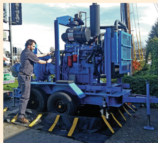
This temporary pump provides backup capacity in the event of large El Niño storm flows.