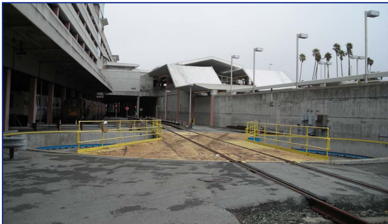
Figure 5: BART Rail Turntable

Because open space is difficult to obtain at the SMCSD site, it is recommended that a truck turntable be installed to facilitate waste hauler access. In addition, the access road and loading areas should be modified or configured to provide manageable slopes and grade transition for waste hauler vehicles and SMCSD maintenance staff.