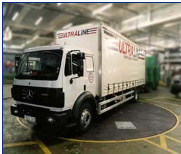
Figure 3: Truck Turntable

Another option to improve vehicle maneuverability would be to install a truck turntable. An example of truck turntable is shown in Figure 3. The inside of a partially assembled turntable is shown in Figure 4.