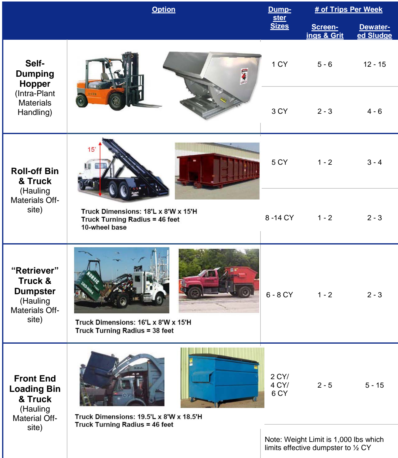
Figure 1: Summary of Material Handling Storage/Disposal Bin Options