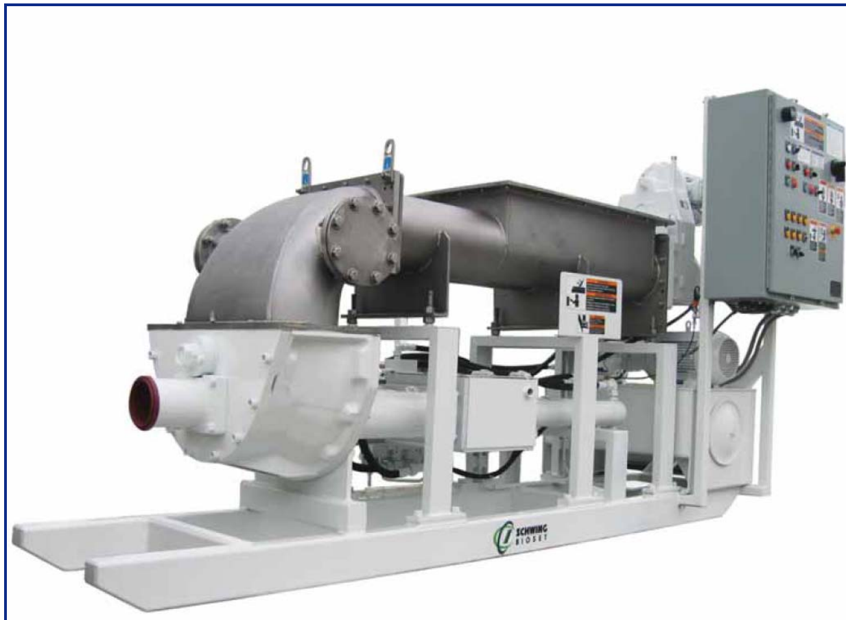
Figure 6: Package Cake Pump

Another potential alternative would be to relocate the existing screw press to the new materials handling area. The screw press could be installed on an elevated platform above, and discharge directly into, the new dewatered sludge roll-off bin. All the piping and electrical connections to the screw press would