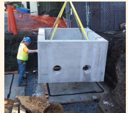
Pump station upgrade underway.

24/7 Reliability. The many hills and valleys in our community require us to pump wastewater from homes and businesses to the treatment plant. To ensure they operate 24/7 without fail, the District undertakes extensive pro-active testing, maintenance, and upgrades on these pumps.